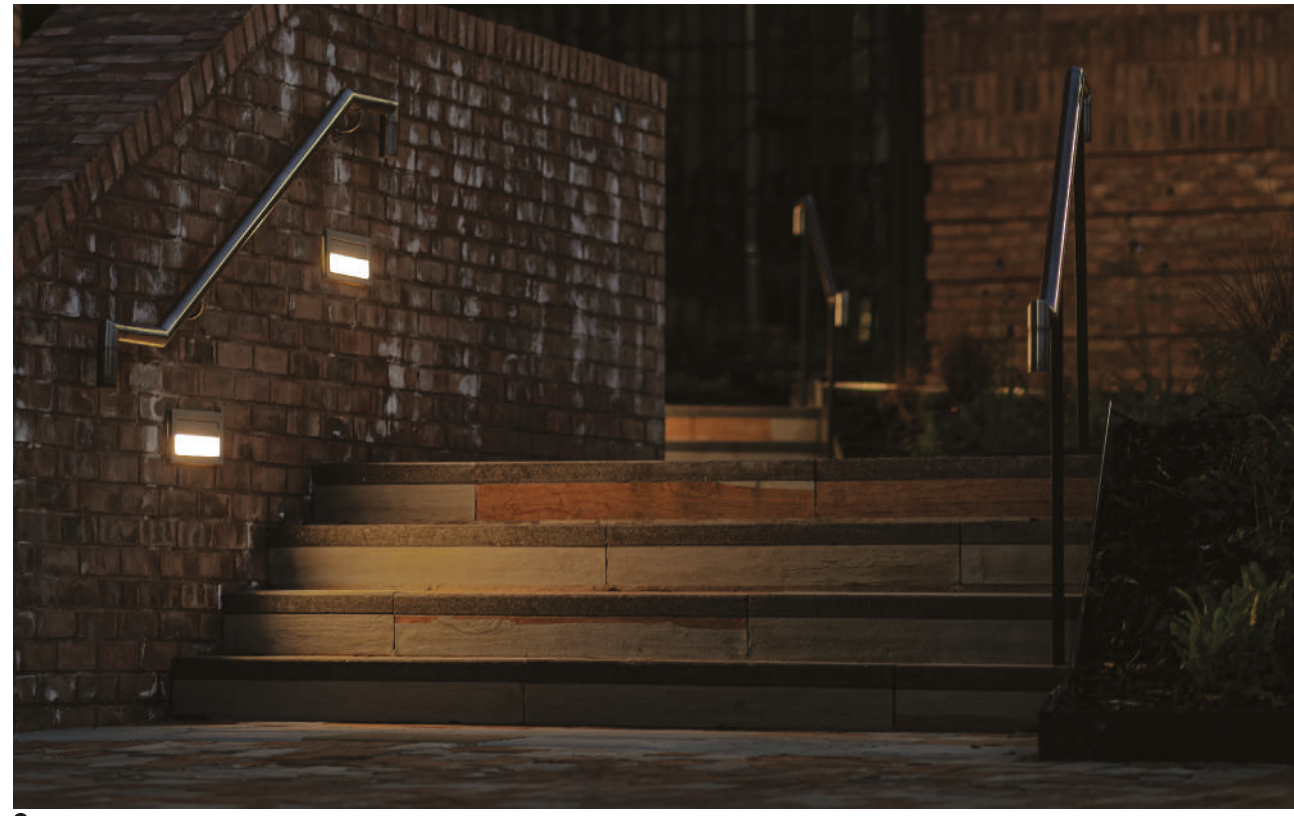
P Hudson Quarter York - York, United Kingdom