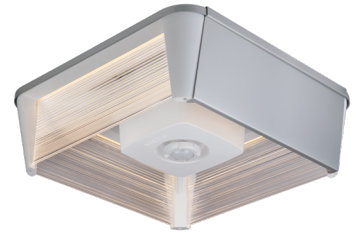
Side Light Shield (IG-SLS)