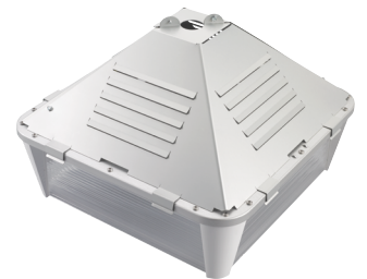
Bird Shroud Kit (IG-BG)