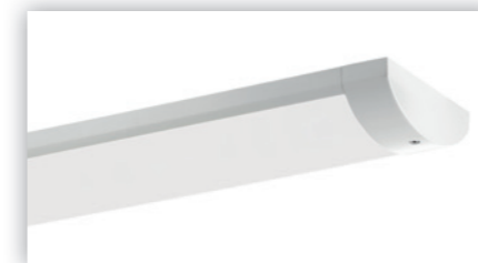
Homogeneous light distribution