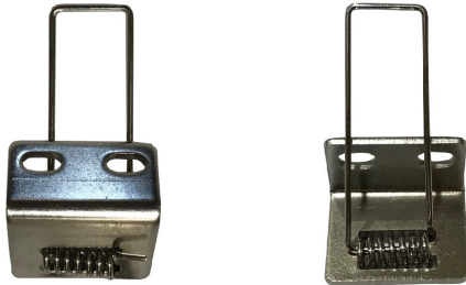
PLASTER RECESS CLIPS (CODE: PRC-PNLA)