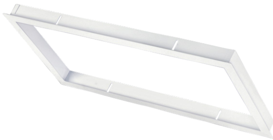
PLASTER RECESS FRAME* (CODE: PRF606) DIMENSIONS: 630MM x 630MM x 40MM CUT OUT DETAILS: 610MM x 610MM