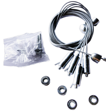
SUSPENSION MOUNT KIT (CODE: SPMK-PNLA)