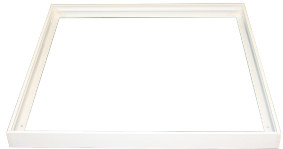
SURFACE MOUNT KIT (CODE: SMF-PNLA22)

*600mm x 600mm frame not pictured. Image for illustrative purposes only.