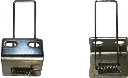
PLASTER RECESS CLIPS (CODE: PRC-PNLA)